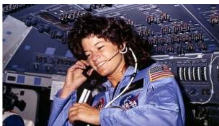
Sally Ride

are less overt today, bias still remains.